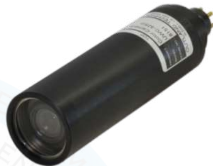
PART NO : SY-UWC-325/p/e