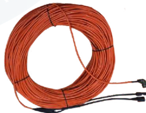
PART NO : SY-VC-150M (length)